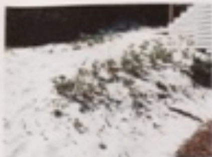
ERLEDA VINE TENDER PEGS